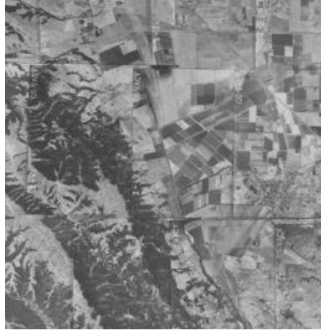
Pleasanton aerial photo collage, 1960

We returned home and told some friends about our encounter. They wanted to come back and try to hunt it, but I said, "No, it didn't try to harm us. Why would I go hunt it down?"