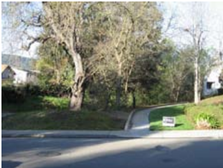
Gold Creek, Pleasanton, 2008.

I made my way to that spot and my friend reluctantly caught up with me. We noticed several large indentations in the mud that were approximately 20" long and 7" wide. They were tracks but no detail of the foot was evident. I think this was due to the fact that it was clumping up mud on its feet as it ran across the field. That's what happened to my boots as I followed it – wet, sticky mud accumulated on my boots. The indentations were deep (approx. 3") and there was a very long stride between them. It departed in the direction towards where the creek splits in a "v" configuration. We went that far but no further in pursuit of this creature. It never made any threatening sounds or motions, but it was very big and quite unusual.