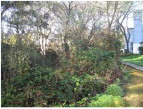
Gold Creek, Pleasanton, 2008

get a better look at it against the protests of my friend. He was quite shaken by what he saw. I didn't run after it, but was following it at a trot. It angled around through the field stopping now and then to look back at us. It made its way back to the creek and the dense growth and stopped to take one last look. I clearly saw it looking through some branches of a tree along the farm road beside the creek. It then turned and disappeared into the dense growth of trees and bushes along the creek.