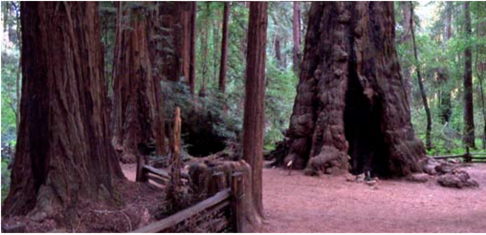
This is a scene from the Redwood grove that is just across the river from Gold Gulch cabin (M.Rugg). ...continued from page 1

I'm still not sure what we're going to call it... The Bigfoot Lodge, perhaps. But whatever the final name, it will consist of three cozy and disinctive bedrooms, a common bathroom and a great room with a common kitchen and room for numerous dining tables and chairs. It will feature a woodburning stove, research library and audio-video equipment. This room will be a gathering place for guests for many activities and events, including conferences, symposiums, lectures, miniconcerts, classes and workshops, parties, meals and more.